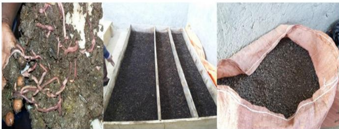
Fig.1 Vermicomposting Technologies

*. **, ***Significant at p<0.05, p<0.01 and p<0.001, respectively; NS= not significant. Means with the same letter in column are not significantly different at p<0.05; LSD: Least Significant Difference; PH: plant height, AGB: above ground biomass, FD: Fruit diameter, VC: Vermicompost, DBP: Day before planting and RN= recommended nitrogen.