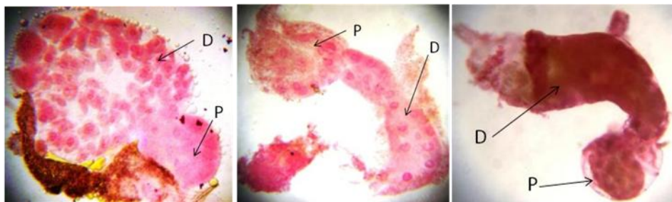
Fig.2 Microphotographs of Larval Salivary Gland