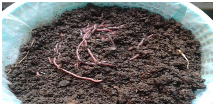
Figure.3 Process of Paddy Straw Composting for 40 Days