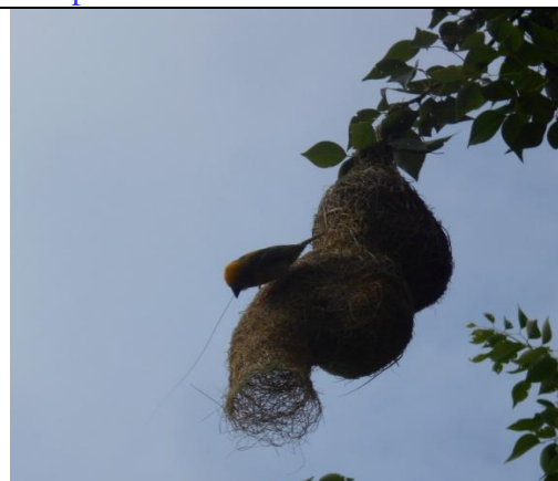
Fig. 4. Male of Baya weaver busy in construction of entrance tube of two chamber nest.

According to Kielgast and Lotters (2009) the weaver nests are used by anuran chiomantis species for the protection after breeding season or depart nesting. To the best of the observation this is the first ever report of utilization of bird nests by amphibians, where as in the present study in the Nanded, Maharashtra, India the nests remain survive and left unused after breeding were not used by other creatures. The observation in the present study area indicates that, the male of this weaver do not destruct their own nests. No further use of the weaver nest except piece of ornament in the home used by some people. It was also found that due to wind waves and impact of high temperature of summer there was formation of a hole (3-8