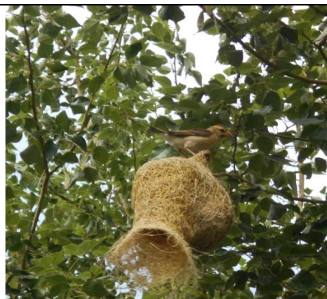
Fig. 3. Female of Baya weaver with complete nest.