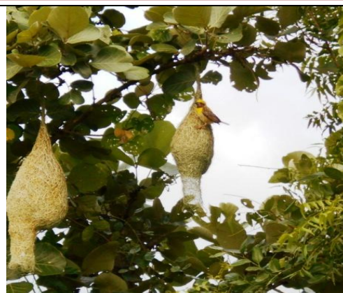
Fig. 2. Male of Baya weaver with complete successful nest.