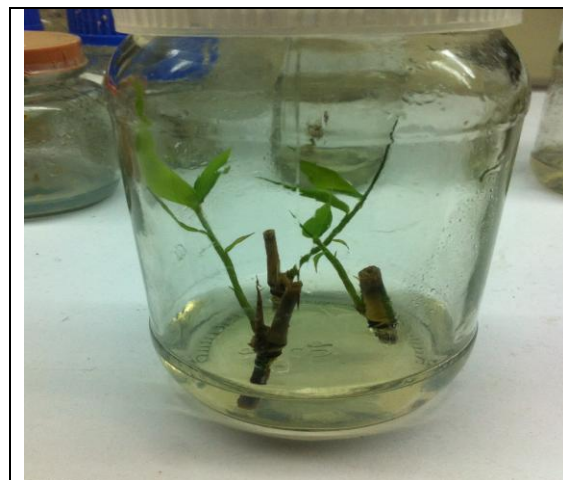
Fig.5 Effect of IBA (2.0 mg/l) in rooting