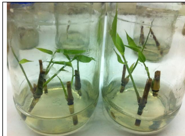
Fig.3 Shoot multiplication MS with BAP (1.5mg/l) and Kn (2.0 mg/l) after 2 weeks