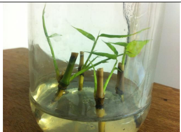
Fig.4 Shoot multiplication MS with BAP (1.5mg/l) and Kn (2.0 mg/l) after 4 weeks