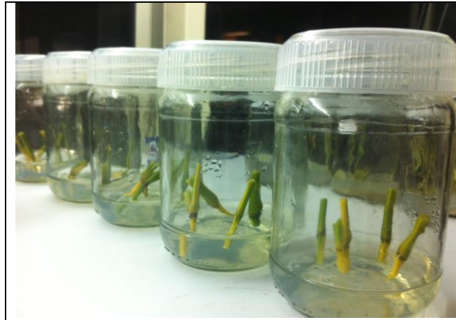
Fig.2 Explants were inoculated on MS medium