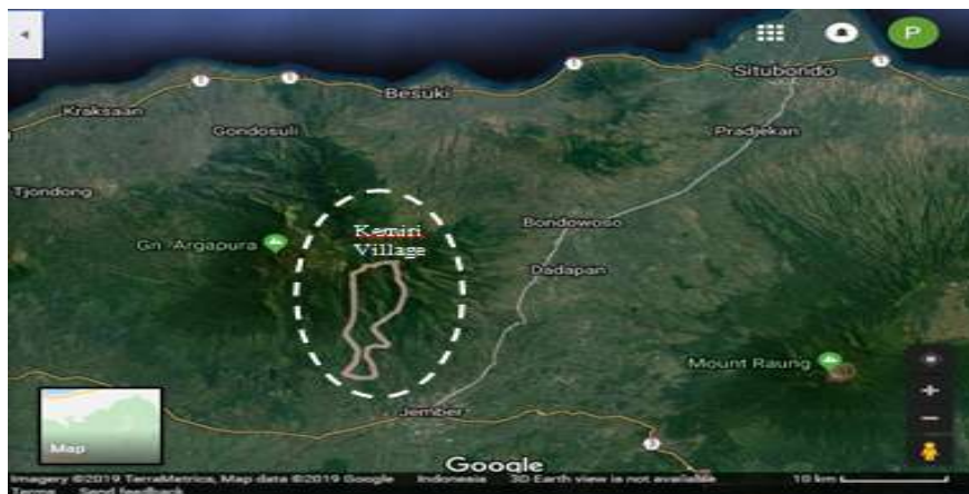
Figure.1 The study area at Kemiri Village, Panti Sub-District, Jember District, East Java Province, Indonesia

Species that are either tolerated or adapted to grazing (e.g., low palatability, adapted growth form) can react with compensatory growth, or even increasing productivity (McNaughton, 1983), and they are thus favored.