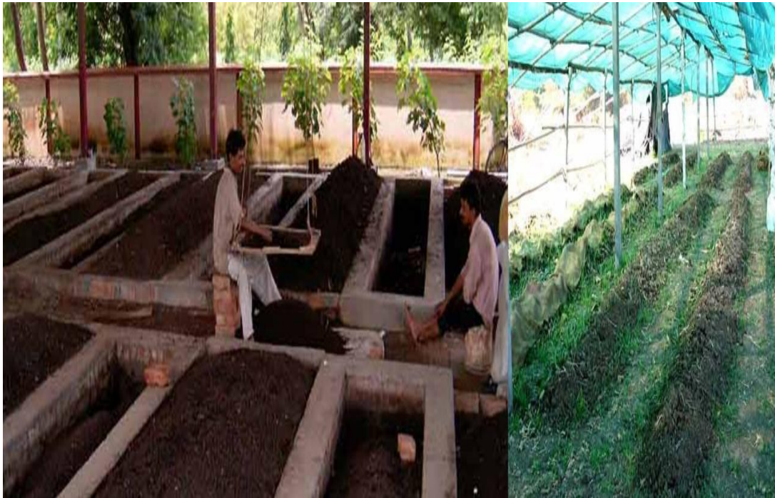
Figure.5 Vermicompost harvester (manure sieve)