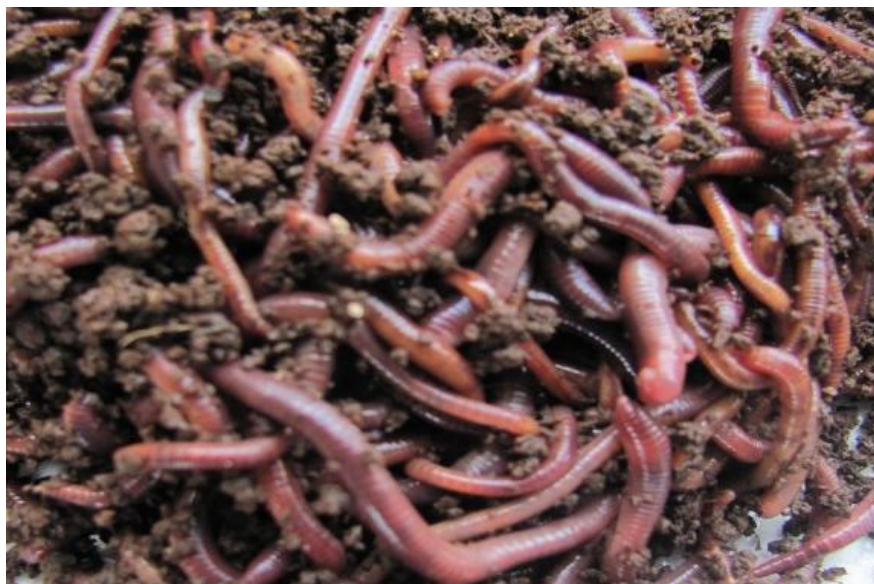
Figure.3 Vermicomposting beds under thatches shade