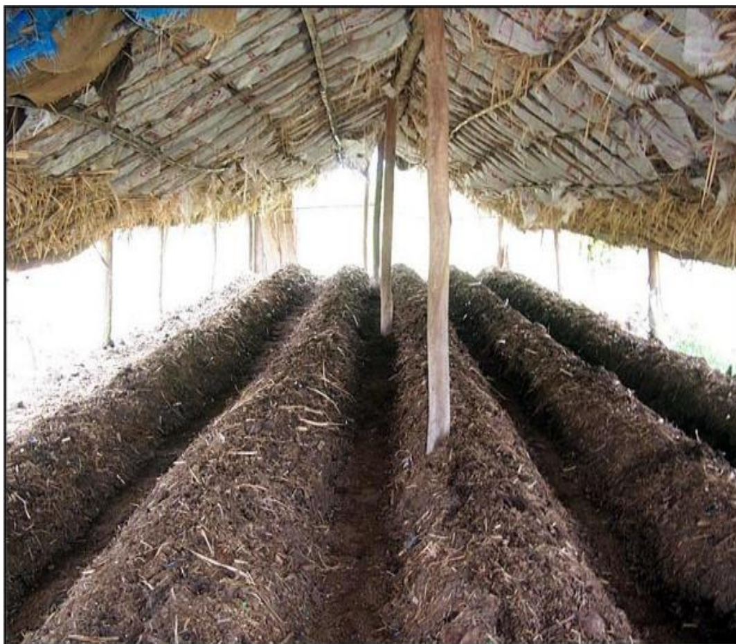
Figure.4 Cemented and shed net house vermicomposting beds