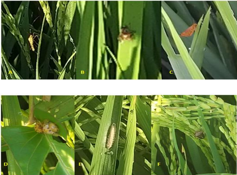
Fig.3 Total population of natural enemies (individuals)