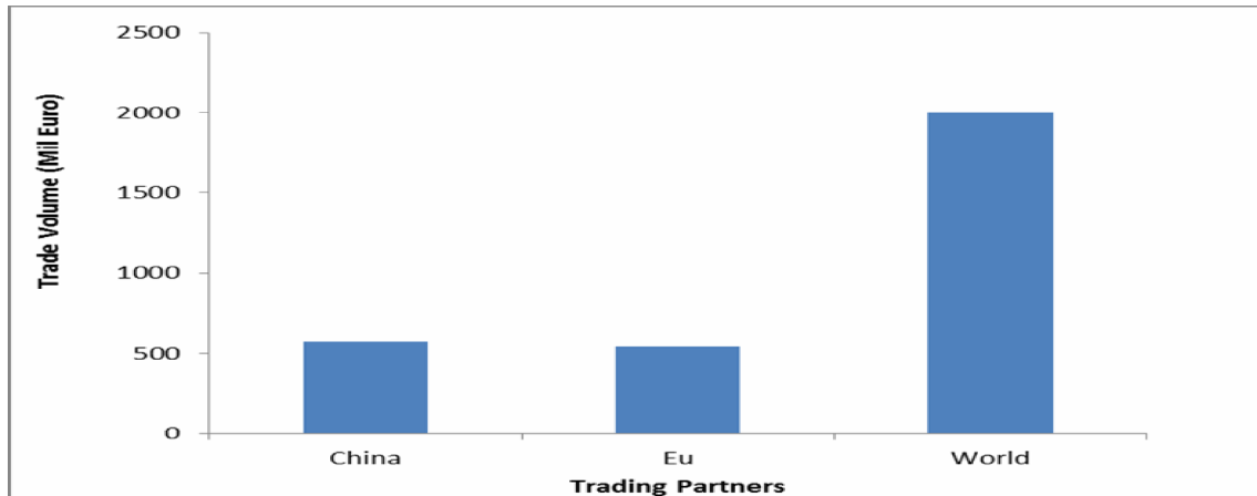
Figure.1 Sierra Leone’s total trade value with partners in million Euros, 2012