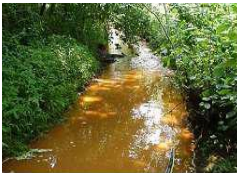
Fig.2 Waste disposal